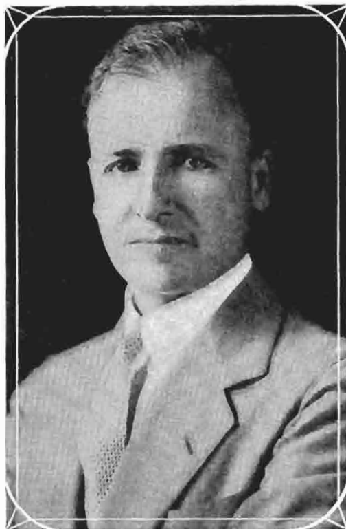
DR. J. H. DELLINGER

The fact that the number of channels is limited and the number of stations assignable to any one channel is again limited, imposes upon the Government the necessity of choice among applicants for the radio channels. This is indeed the underlying reason why a Federal Radio Commission came to be created. To provide for choice among those who aspire to construct and use radio stations, Congress created not only the Commission as its instrument to make the choice, but also a judicial principle to be the basis of choice, viz, the