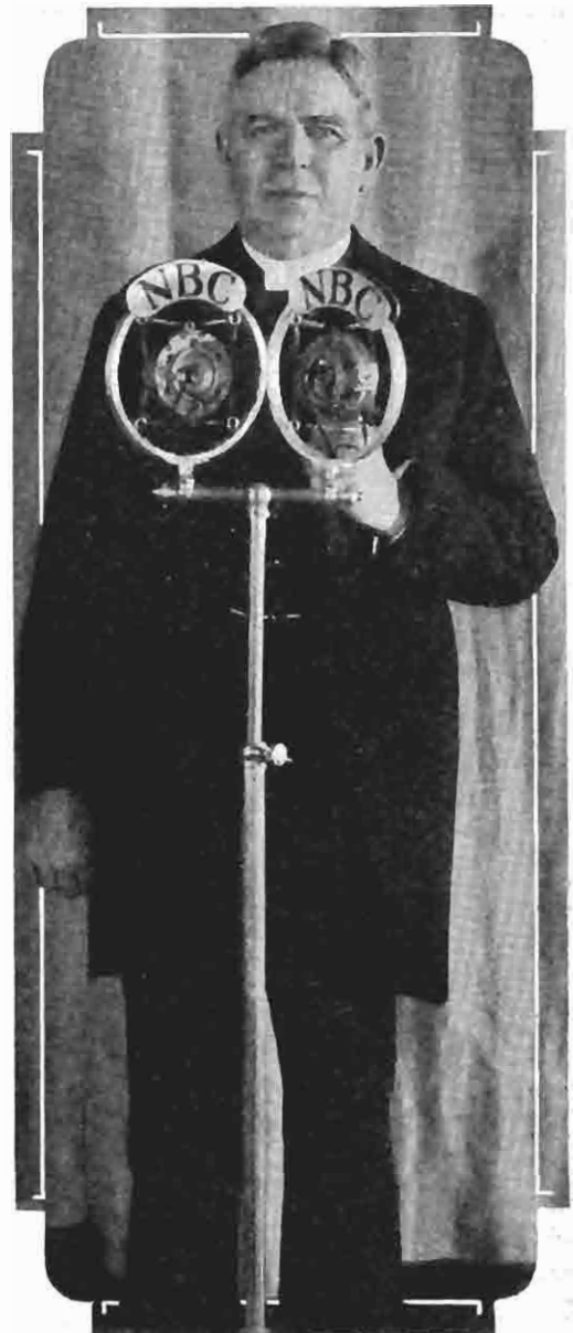
DR. S. PARKES CADMAN

Dr. Cadman receives thousands of letters each week from members of his congregation throughout the country asking his advice on almost every subject imaginable. He tries to answer as many of these letters as possible.