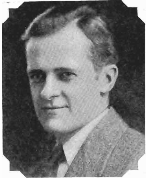
THE SOLEMN OLD JUDGE

Then Hay deserted the South for Chicago about two years ago to become chief announcer for WLS there; he left the "Hushpuckiny" in Memphis and started across country with the locomotive as his radio vehicle. Radio listeners soon learned that when they tuned in on the long, hoarse whistle of the locomotive they would hear the familiar, cheery voice of "The